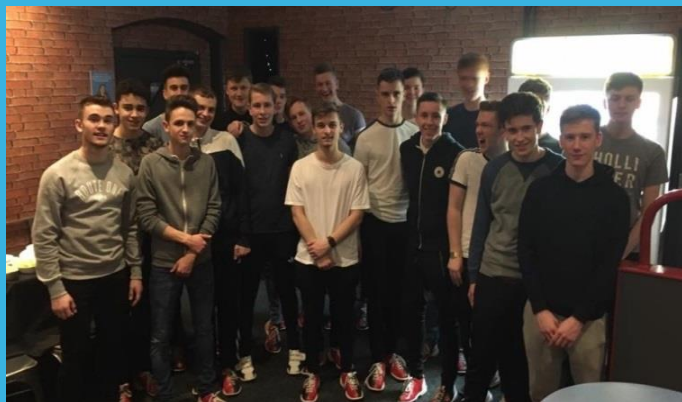
Merry Christmas and Happy New Year to all!”

The boys went bowling for Christmas and are pictured below.